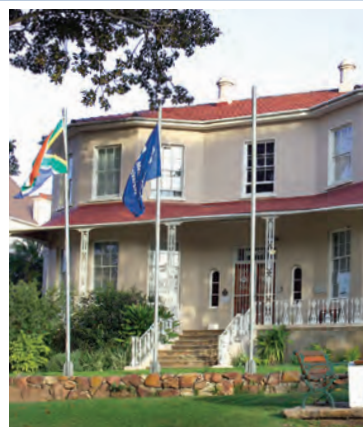
Bird Street Campus