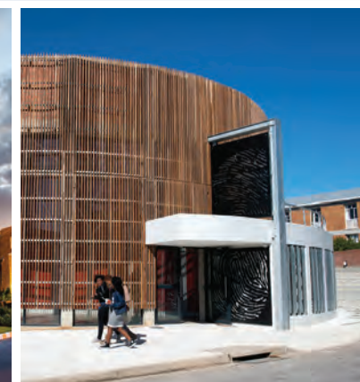
Second Avenue Campus

PO Box 77000 • Nelson Mandela Metropolitan University Port Elizabeth • 6031 • South Africa