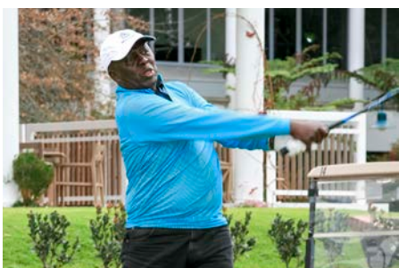
Teeing off - Former Deputy Chief Justice and Wits Chancellor Dikgang Moseneke.