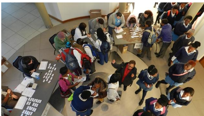
Learners from the Southern Cape registering for the INVESTEC / NMMU Accounting Winter School held at the NMMU George Campus during the winter recess.

The BCom Accounting programmes, offered both at NMMU's Port Elizabeth and George campuses, are high in demand and continue to attract high calibre students who achieve excellent academic outcomes. Judging from the enthusiasm of the learners, it is anticipated that the winter school will encourage an increased uptake of this qualification in George.